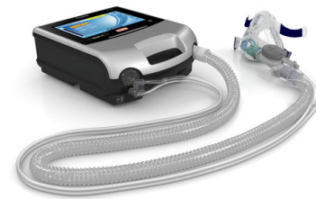
Astral single limb valve

in leak and valve ventilation for invasive and noninvasive use. The combination of its internal and external batteries delivers an impressive 24-hours total runtime. So patients can now go longer and travel further, knowing they have the reliability of Astral behind them. Combined with the lightweight Quattro Air NV full face mask, ResMed delivers a complete therapy solution designed for performance and comfort.