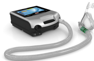
Astral single limb leak